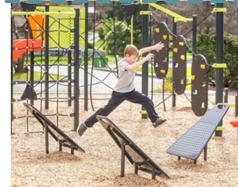
Older Children's Play Area