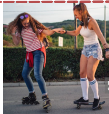
Active Recreation / Youth