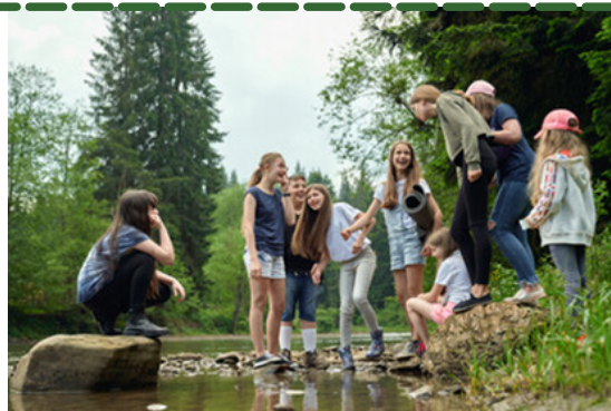
Natural Setting, Trails and Interpretation