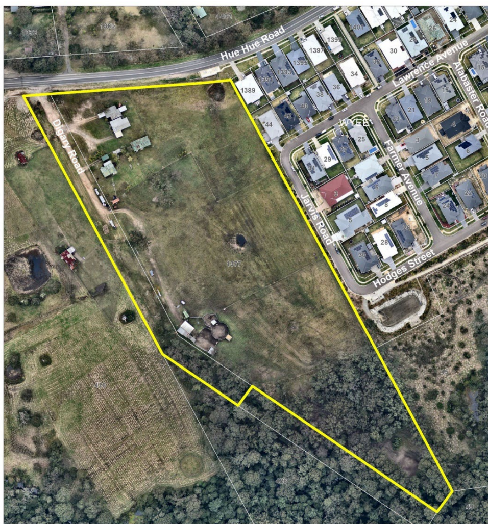
Figure 1: Subject site

The planning proposal relates to land at 1377 Hue Hue Road, Wye and part of the adjoining Digary Road. The northern part of the site is currently zoned RU2 Rural Landscape and the southern part is zoned C2 Environmental Conservation. The portion of the site zoned RU2 Rural Landscape has historically been used for agricultural and rural residential purposes and is almost completely cleared of vegetation with only a few scattered trees remaining. This portion of the site also contains two residential dwellings, rural sheds and structures associated with keeping horses. The portion of the site zoned C2 Environmental Conservation contains some remnant forest, as well as a small section of Mannering Creek flowing through the far southern corner of the site.