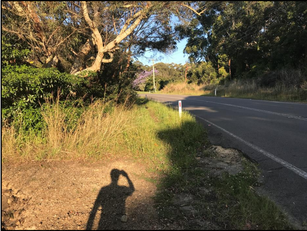
Photo 1 – View to left for a driver exiting the subject site. Note heavy vegetation impacts on the sight line