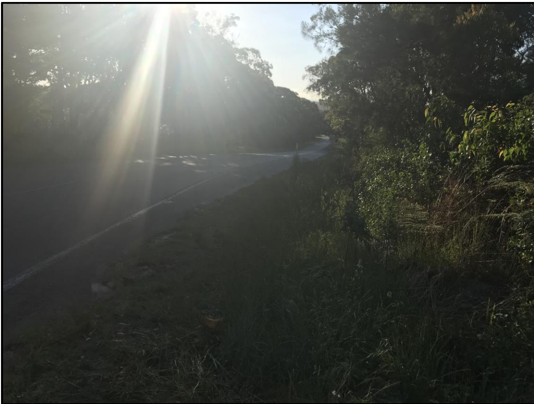
Photo 2 - View to right for a driver exiting the subject site. Note heavy vegetation impacts on the sight line