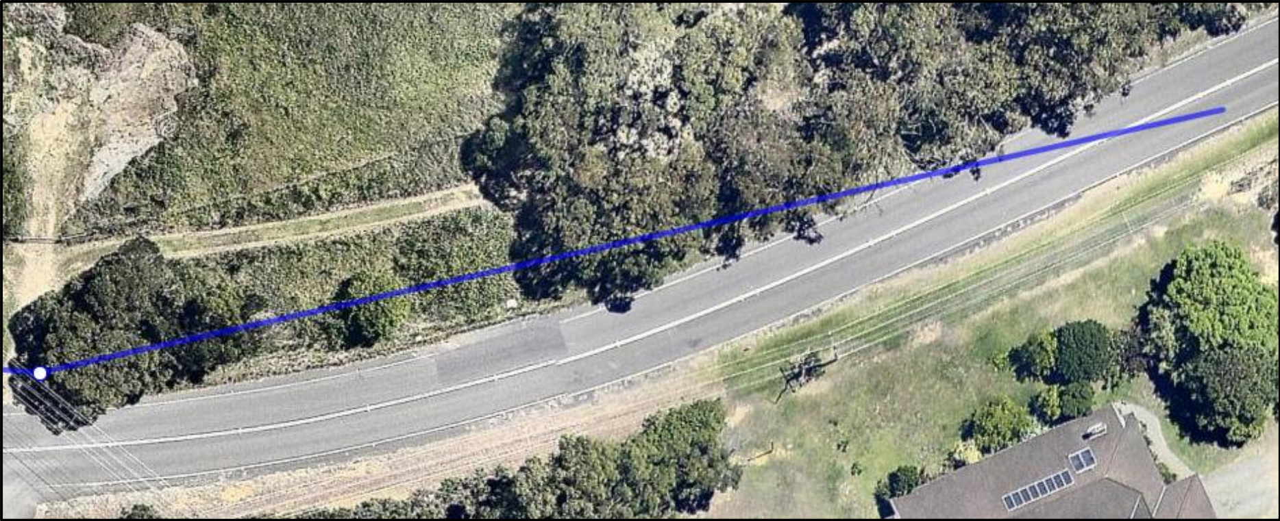
Figure 1 – Area required for vegetation clearance for the sight line to the left for drivers exiting the site.