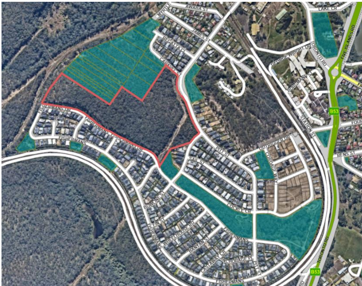
Figure 2 – Land to be dedicated at 5 Caravel Street, Teralba (red border) and existing Council-owned land shaded green

create a contiguous area of Council-owned land which features a prominent ridgeline in this part of the city. The land to be dedicated to Council is shown in the red border in Figure 2 below. Existing Council-owned land in the area is shown shaded green in Figure 2.